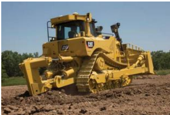
Working @ All over the world