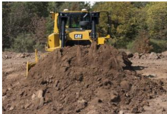
Working @ Reclamation