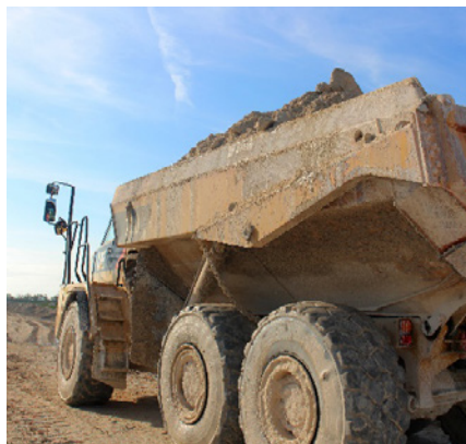
Working at: sandworks.