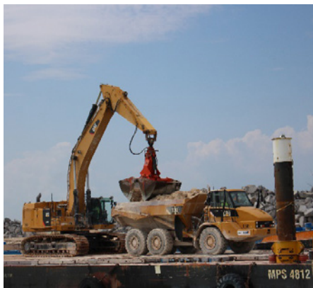
Working at: rockworks.