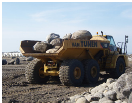
Working at: rockworks.