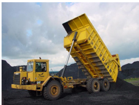
Working at: The Netherlands - Earlyadapter on ADT's.