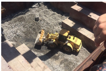
Working at: In a ship / Rock works.