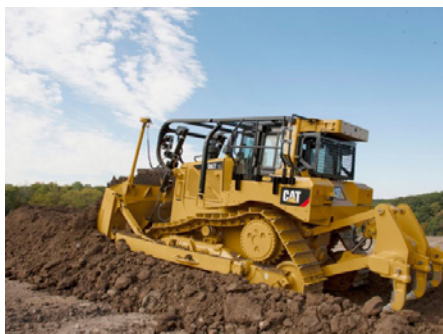
Working at: all over the world.