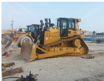
Working at reclamation