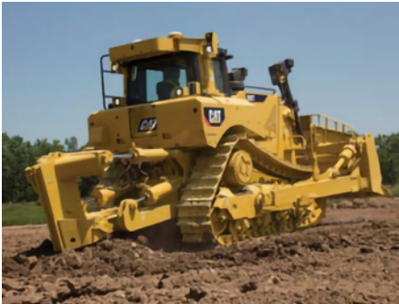
Working at: all over the world.