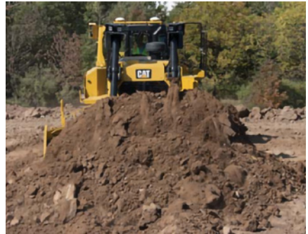
Working at: reclamation.